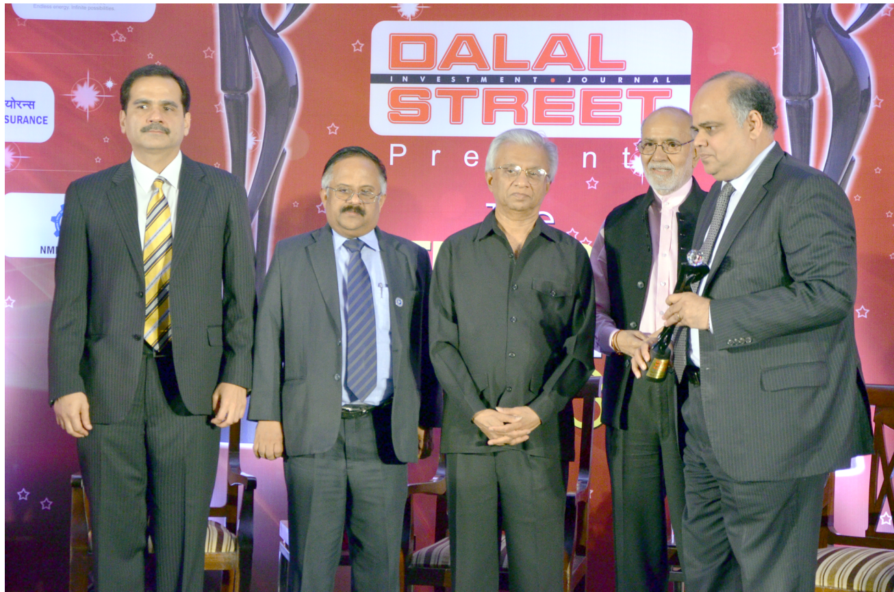
Overall Outstanding Performance Award in General Insurance (PSU) for 2013 from Dalal Street Investment Journal