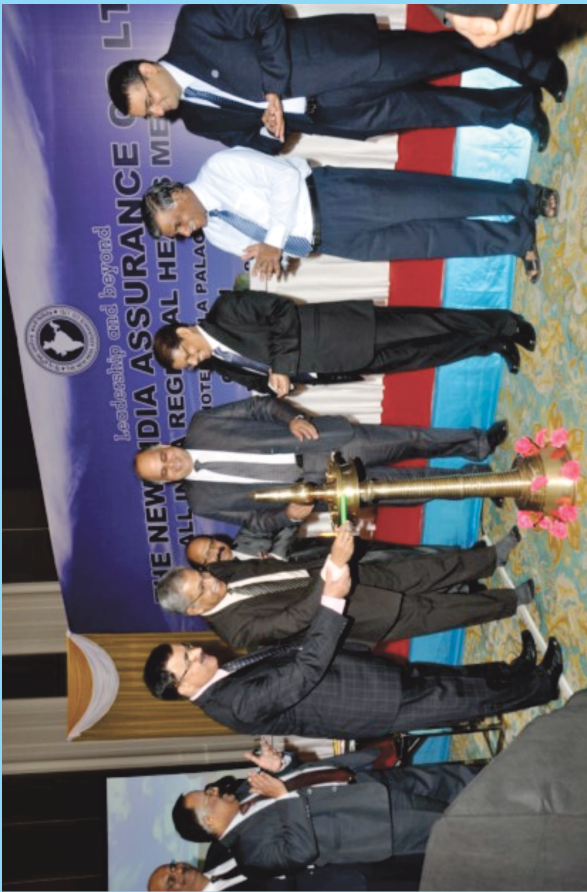
Regional Managers Conference at Chennai